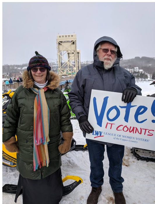
LWVCC members stressed the importance of voting at the Women's March January 19, 2019.