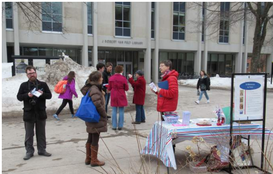
Our Equity Payday event on MTU Campus April 10 th reached about 200 people in the two cold hours we spent at the Husky Statue.