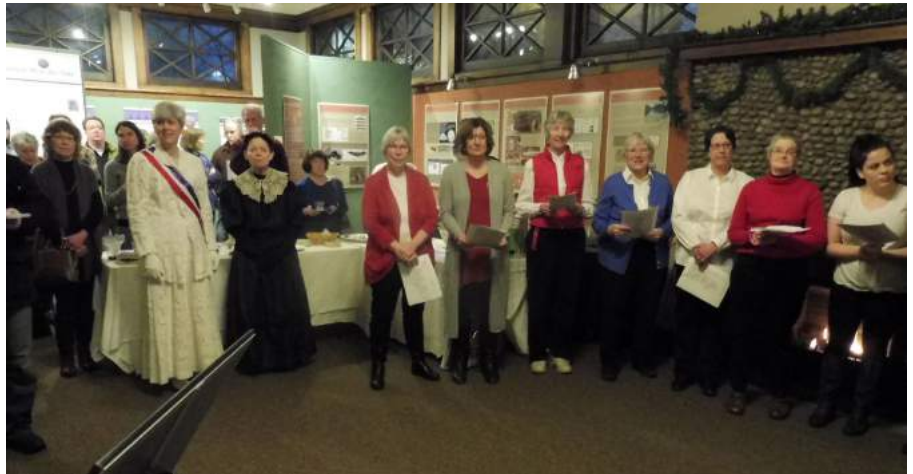
Members of Women's section CC Chorale and Friends of Fashion.